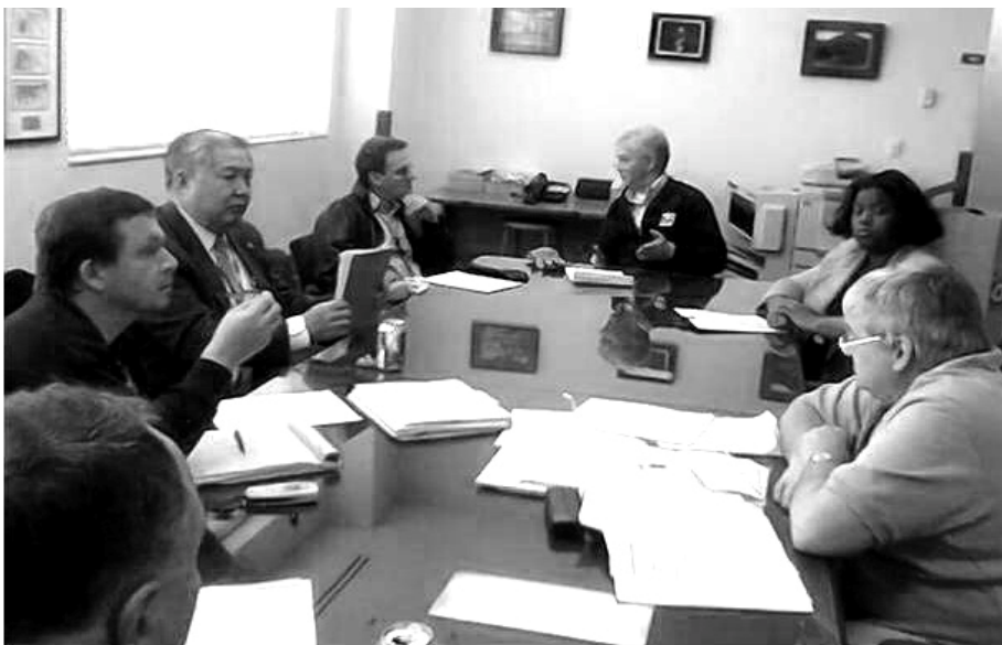
Branch 4319 bargaining committee negotiates with Anchorage USPS Officials

We will cover what to do in case of an impasse in a future article. However, it is best to plan ahead